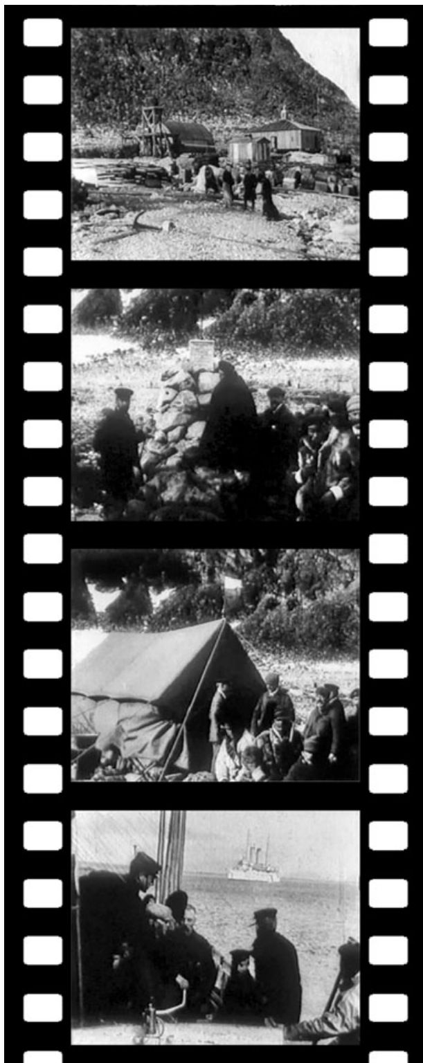
Figure 3 More stills from the film. From top to bottom: the base camp at Virgohamna built by the Wellman expedition in the summer of 1906, with the machine shop and hydrogen generator to the left and the Chicago Record-Herald House (also called the Wellman House), with the American flag, to the right; Wellman examines the cairn monument built on the site at Virgohamna where the Swedish balloonist Salomon A. Andrée lifted off in July 1897; the tent at Virgohamna where Wellman found German newspaper correspondent (and nominal spy: see Capelotti et al. 2007 [this issue]), Otto von Gottberg; Wellman tips his cap to the camera as a small steam launch takes him to a waiting passenger liner anchored offshore—as described in the excerpt from Tromsøposten , this may have been in order to meet the passengers over dinner.

Lantern Weekly advertises the film as being 500 ft in length. The 1906 film is eight minutes long and lacks intertitles, which was not unusual in films of this era (Thompson & Bordwell 2003). The scenes do not appear to have been edited entirely chronologically: there are sudden jumps from mainland Norway to Spitsbergen and back again to the continent.