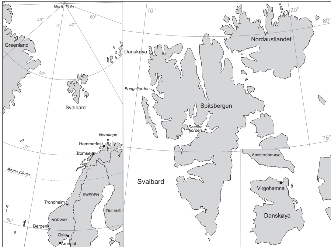
Figure 1 Sketchmaps of Scandinavia, Svalbard and Danskøya.

Wellman?" The newspaper had found it warranted to print a more rounded presentation of the man: