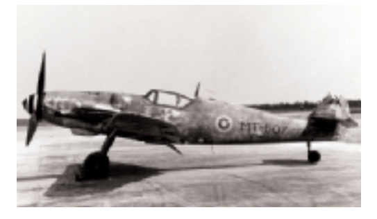
Fig, 1. Messerschmitt Bf 109 G-6, MT-507, has been taken into service in late summer 1949 at Finnish Air Force 31st Fighter Squadron after a long storage period and is thus practically factory-new.

What is the conceptual identity of MT-507? Is it the performance specification drafted by the Air Ministry of the Third Reich (Reichsluftfahrtministerium, RLM), the first flight of the Bf 109 V1 prototype on 28 May, 1935, or the maiden flight of the Bf 109 G-0, which was the first pre-production "Gustav"? Hermann Göring's announcement that a "very fast courier airplane" was required does certainly not qualify as the conceptual identi-