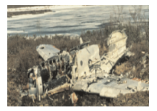
Fig. 2. Messerschmitt Bf 109 F-4, Luftwaffe NE+ML, at the shore of Lake Tsiegalasjärvi at the beginning of June 1972 before transportation to the Finnish Airforce Depot and later (1978) to the Aviation Museum of Central Finland.

In my opinion, the factual identities of the Messerschmitts that are the subject of this stu-