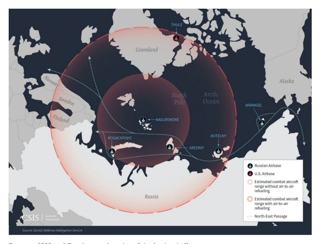
Ranges of US and Russian combat aircraft in the Arctic.33

With EABO's focus on "sea denial, sea control, and fleet sustainment," the Marine Corps is back to emphasizing their requirement to enable the Navy to maneuver and succeed at its maritime mission. The Department of the Navy recognizes that "While US forces remain dominant in open oceans, the A2AD (anti-access/area denial) systems credibly threaten vessels in close and confined seas relatively near to adversary territory." Thus, the Marine Corps' EABO concept argues that the battle space on the coasts, straits, littorals, and areas characterized by confined spaces for naval ships to maneuver requires an integrated operational approach. The idea is that the lighter, faster, less easily detectable Marine Corps will conduct "expeditionary warfare." They will insert themselves under an adversary's WEZ and open their own A2AD umbrella to clear a space where naval ships and follow-on forces can transit. 32