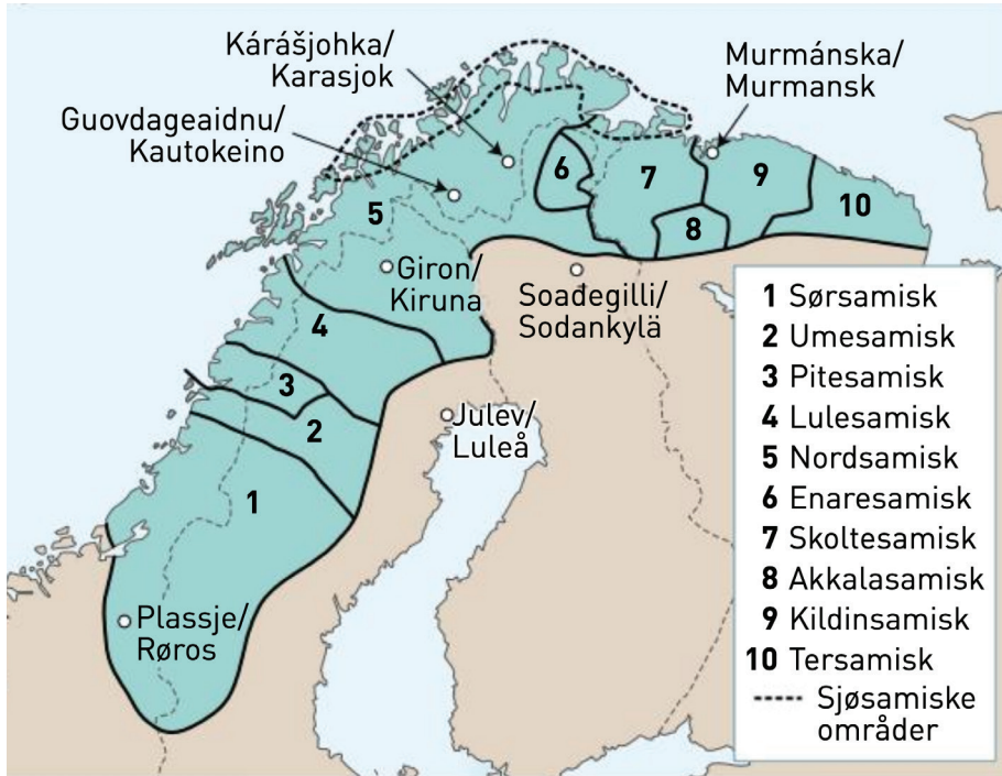
Figure 8.2: ‘The area of different Sámi languages’ (Blichfeldt et al., 2020, p. 252).

the opening of a six-page chapter about Sámi ( ‘Litt om samisk’ ) in the textbook by Bech et al. (1998, p. 168, italics by textbook authors, our bold types for pronouns and social categories):